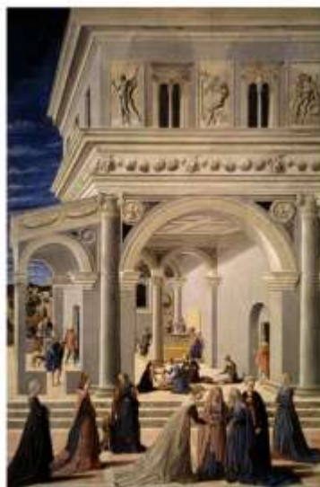
Birth of the Virgin